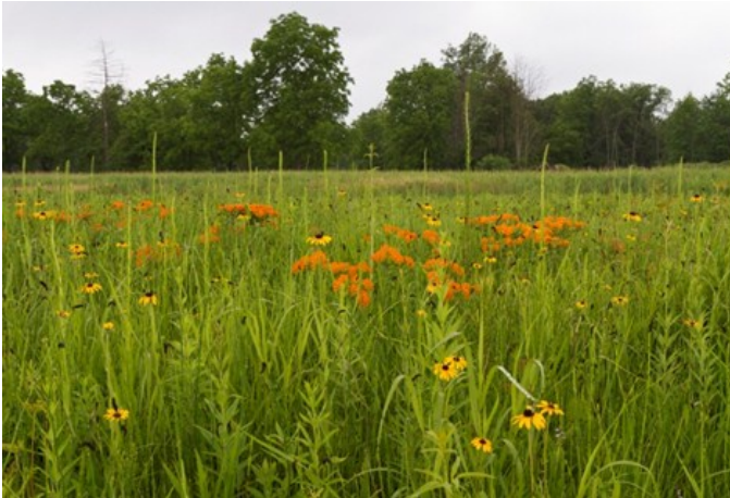
Island Prairie on Walpole Island.

The Parkway and Walpole Island both feature remnant Tallgrass Prairie, one of the rarest and most endangered ecosystems in the world. The species at risk that are found on Parkway restoration areas are also found on Walpole Island. Species at risk on the Parkway are protected by permits issued under the Endangered Species Act, 2007 (ESA, 2007) . WIFN encouraged the Parkway team to consider the protection of the entire shared ecosystem, and not just individual species. This ecosystem perspective has guided MTO's environmental approach for the Parkway.