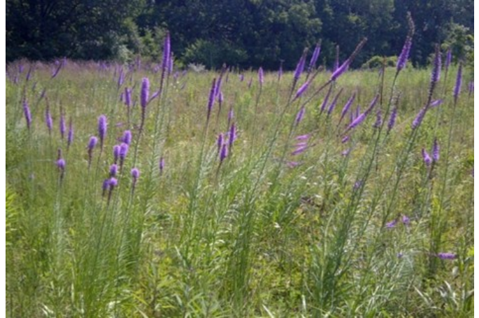
Parkway restoration area.

“WIFN’s philosophies, values and practices of interacting respectfully with the natural world and not separating themselves from it, has directly contributed to the continued existence of the natural areas and many wildlife species, both common and rare, found on Walpole Island.”