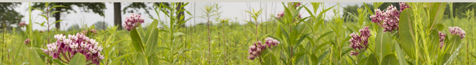
Walpole Island Prairie.

The relationship that exists today between Walpole Island First Nation (WIFN) and the Ministry of Transportation (MTO) on the Rt. Hon. Herb Gray Parkway (the Parkway) began in 2004 during the early planning stages for a new end-to-end border transportation system in the Windsor-Detroit Gateway. The relationship has broadened to now include the Windsor Essex Mobility Group (WEMG) and Parkway Infrastructure Constructors (PIC), the companies designing and building the Parkway.