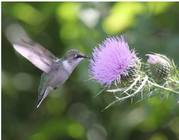
A hummingbird on Walpole Island.

MTO has engaged WIFN not just as observers, but as active partners and valued contributors to the project. WIFN community members have been present at Parkway events such as Public Information Open Houses and Species at Risk Annual Meetings. The Parkway team has participated in WIFN's Ecosystem Circles, which are a venue to engage the community, learn about nature and the environment, share knowledge and facilitate community involvement and action.